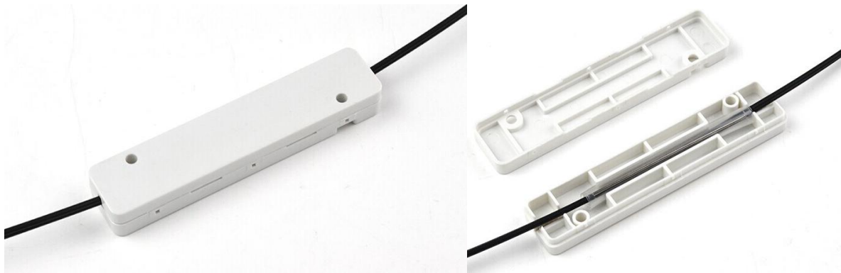
Fig. 2: rectangular type