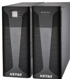
Battery Cabinets. (Optional)